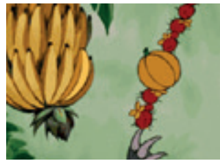
11 The Jungle Book