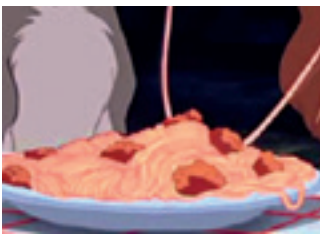
13 Lady and the Tramp