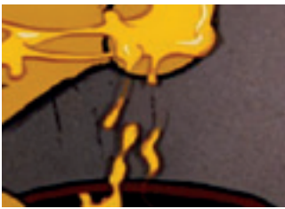
9 Winnie the Pooh