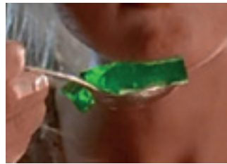
6 Jurassic Park