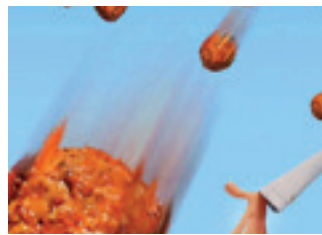
14 Cloudy With a Chance of Meatballs