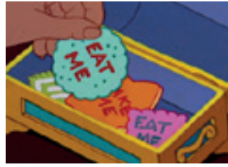
2 Alice in Wonderland