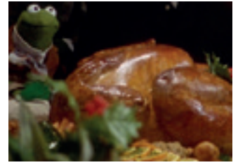
4 The Muppet Christmas Carol