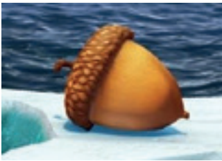
5 Ice Age (Continental Drift)