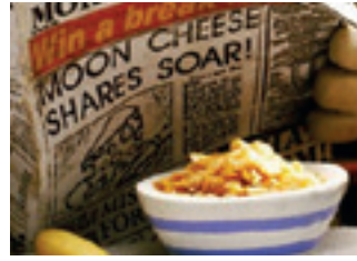
3 Wallace & Gromit (A Grand Day Out)