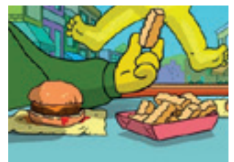
20 The Simpsons Movie