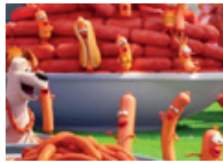
10 The Secret Life of Pets