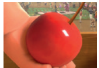
16 Wreck It Ralph