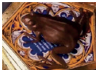
18 Harry Potter and the Philosopher's Stone